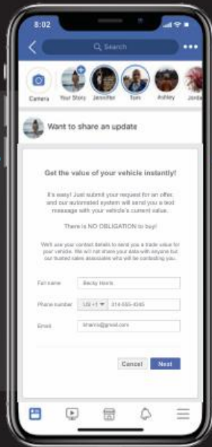
FORM One click or tap seamlessly directs the shopper to the automated interaction