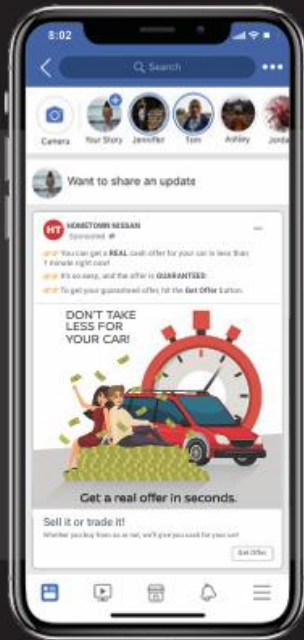
SOCIAL MEDIA Shopper sees an ad offering an instant trade value for their vehicle via text