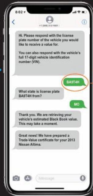
TEXT Text2Trade interacts with the shopper by Automated BDC